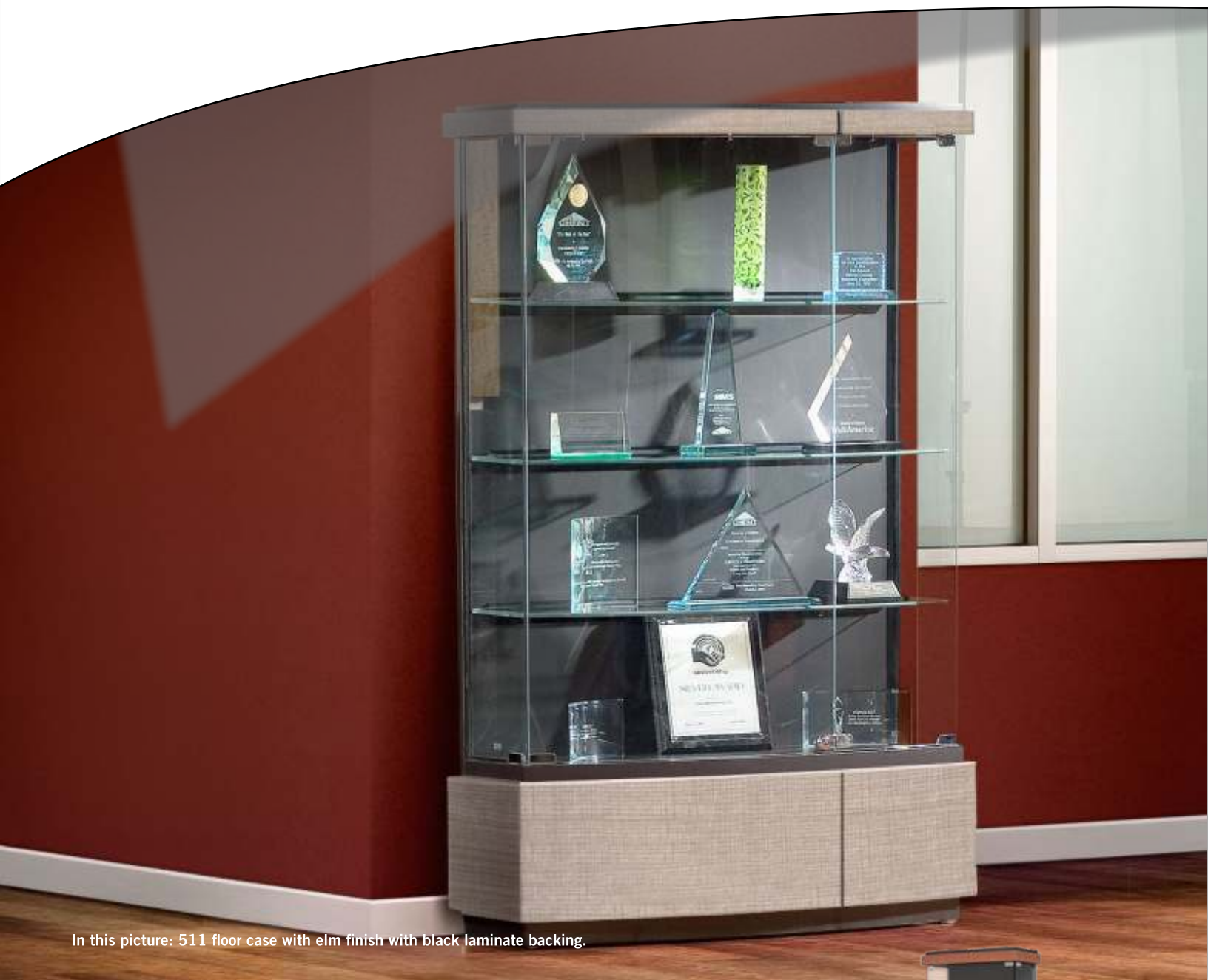
In this picture: 511 floor case with elm finish with black laminate backing.