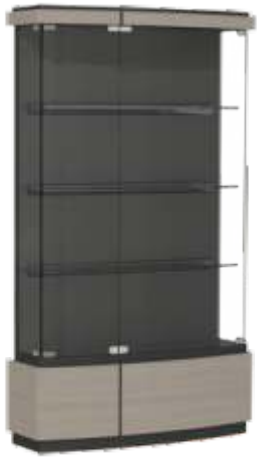
511 - 42 floor case (pictured in elm) laminated case with 3 full-length shelves 73H x 42W x 12D