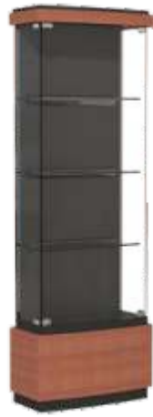
512 - 29 floor case (pictured in cherry) laminated case with 3 full-length shelves 73H x 29W x 12D