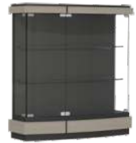
514 - 42 wall case (pictured in elm) laminated case with 2 full-length shelves 44H x 42W x 12D